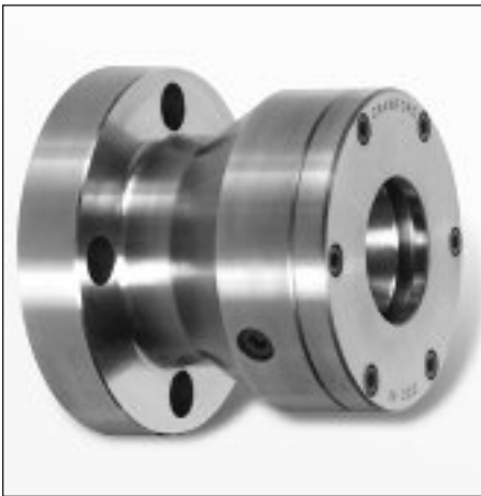
Uses Standard Multibore Collets see page 122